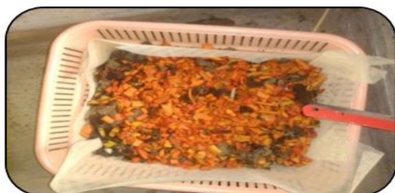
Fig No:07: Tray type 01.