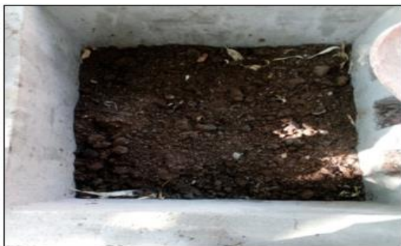
Fig No: 02: Pit loaded with organic material.

A pit of size 6x3x2 feet is constructed in the backyard of the Department using 4 inch brick wall and walls are well plastered both sides. A thin layer of bed concrete is put and a drainage outlet is provided to drain out excess water.