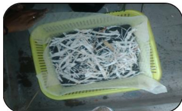
Figure No: 09. Tray type 3.

Tray-3: In this tray Agricultural waste like bagasse, corn outer layer, algae, riverweed, and duck weed are added.