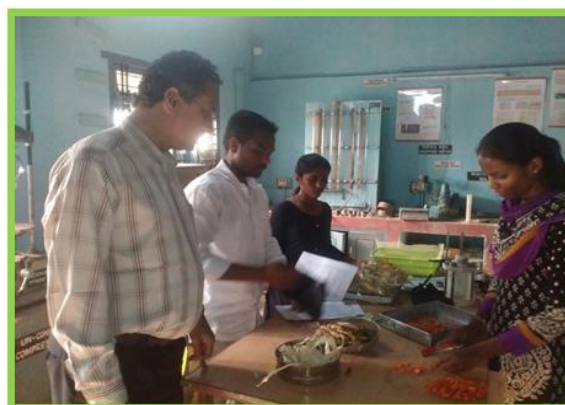
FIG NO 02: Project members preparing ingredients.