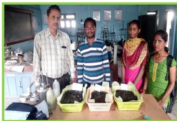
FIG NO 03: Project Team displaying the compost developed.