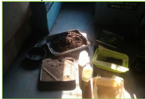
FIG NO 01: Ingredients used in the study.