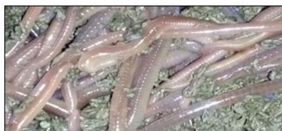
Fig 01: Eisenia Foetida

The Figure below shows the Eisenia Foetida earthworm species used in the work.