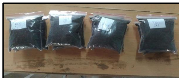
Figure No 10: Compost samples.

Total of Five samples were spawn, where three samples produced from three trays, one sample from bin and one sample from pit sources. The five compost samples sealed and ready to dispatch to university are shown below: