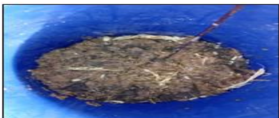
Fig No: 05: Cow dung loaded over corn layer

The worms, cultured in the department, were introduced into Pit, Bin ,Tray with other various organic materials as illustrated earlier.