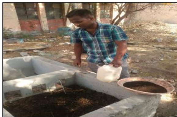
Figure No: 04: Corn and other organic matter loaded in to the bin.

Composting occurred in around 25 to 30 days and the final volume of raw materials was reduced to (1/4) th, or 25% of initial volume.