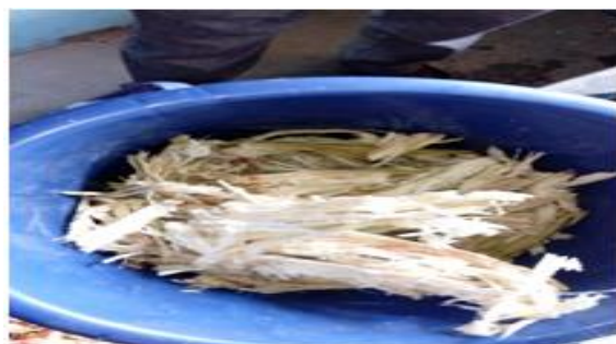
Fig No: 06. Bin loaded with bagasse and other materials.

The worms, cultured in the department, were introduced into Pit, Bin ,Tray with other various organic materials as illustrated earlier.