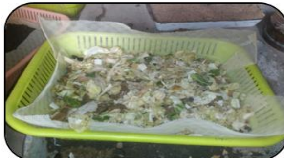
Fig No: 08: Tray type 02.

Tray-3: In this tray Agricultural waste like bagasse, corn outer layer, algae, riverweed, and duck weed are added.