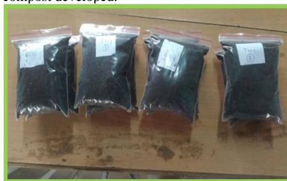
FIG NO 04: Compost samples ready for Laboratory analysis.