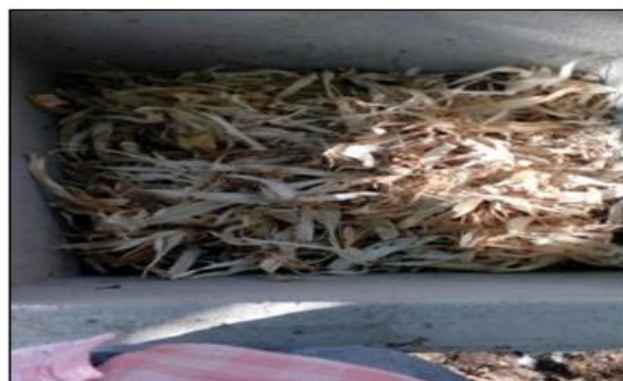
Figure No 03. Pit filled with maize coverings air circulation and to accelerate decomposition.

Bed should be turned once after every 3 days for