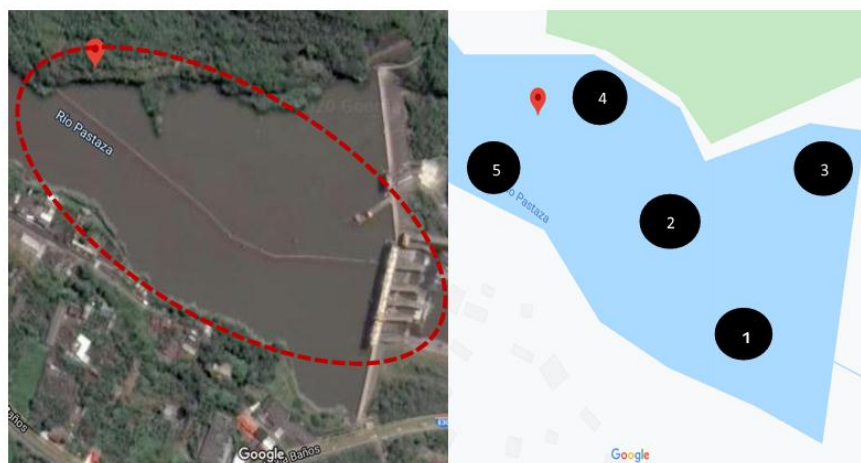
Figure 2. Location and sampling points of the Pisayambo reservoir

In the Figure 2 shows the location and points where samples were taken from the Agoyán reservoir.