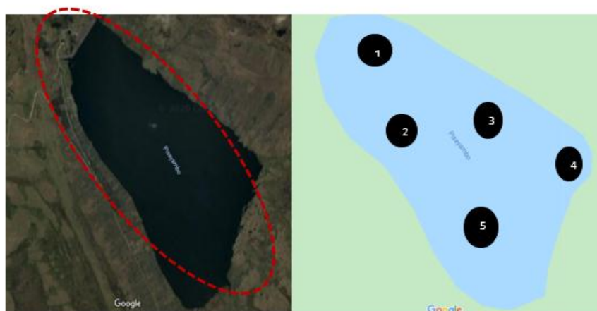
Figure 1. Location and sampling points of the Pisayambo reservoir

Two hydroelectric reservoirs were selected according to their nature, land use pattern in the areas near the reservoir, type and chemical quality of the body of water that feeds the reservoir, among other factors... The Agoyán hydroelectric reservoir is located in the province of Tungurahua, 5 km east of the city of Baños and 180 km southeast of Quito, in the Agoyán sector of the Ulba parish, Los Pinos Camp. At an altitude of 1826 m at the following coordinates: 1°23'52.049''S, 78°23'0.196''W. The Pisayambo reservoir is located within the National Park Llanganates, located in the Eastern Cordillera of the Andes, approximately 40 km from the Píllaro city Province of Tungurahua. Altitude of 3380 m in the following coordinates: 1°5'10.448''S, 78°23'17.482''W. In the Figure 1 shows the location and points where samples were taken from the Pisayambo reservoir.