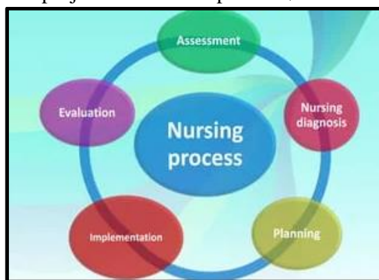
Figure 2: Collaborating nursing process

administrative team and clinical team in the healthcare sector [16]. The collaborative nursing process is unique and helps to resolve all the challenges regarding the management of the team. The protocols that are taken in the collaborative process are smarter and more efficient enough to maintain all the team members of the healthcare sectors. The healthcare segment of the whole world is projected to reach up to US$ 52.65 bn in 2022 and the revenue of the market value of healthcare is projected to reach up to US$ 94.07 bn by 2027 [17].