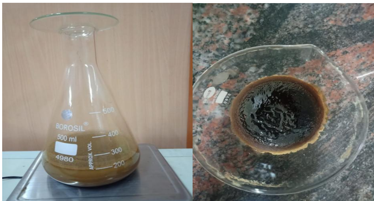
FIG 2:Preparation of alcoholic extract of Triphala