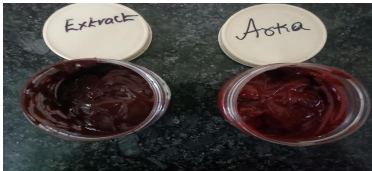
FIG 3:Triphaladi Alcoholic Extract Gel and Triphaladi Arka extract Gel