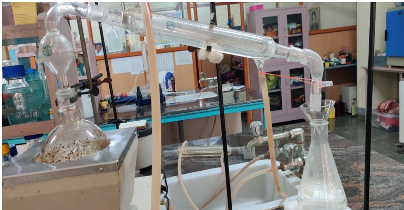
FIG 1:Distillation of Triphala Arka