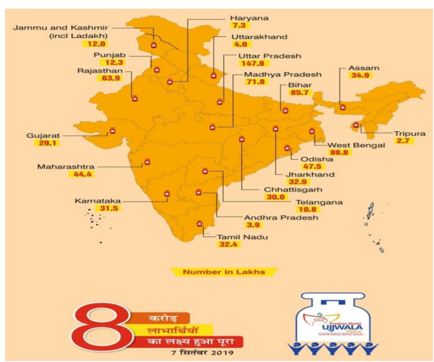
Fig 3. Top 20 State's with Maximum Connection Released under the scheme, Pradhan Mantri Ujjwala Yojana

However, there have been challenges in the implementation of PMUY, such as issues related to awareness, accessibility, and affordability, especially in remote and hilly areas of the state. The government has taken steps to address these challenges, such as providing financial assistance to beneficiaries for the purchase of LPG refills and promoting digital payment modes for transactions. Overall, the implementation of PMUY in Himachal Pradesh has been successful in improving access to clean cooking fuel and enhancing the quality of life of women in rural households.