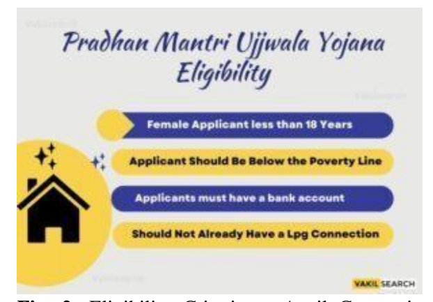
Fig. 2: Eligibility Criteria to Avail Connection Under Ujjwala

These eligibility criteria are designed to ensure that the scheme benefits the most vulnerable households and reaches those who do not have access to clean cooking fuel.