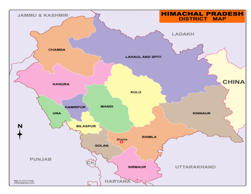
Fig. 1: Location Map of the Study Area, Himachal Pradesh state

The economy of Himachal Pradesh is predomi nantly agricultural, with over 90% of the population engaged in agriculture and related activities. The state has a rich biodiversity and is known for its horticulture and forestry industries. The state also has a significant tourism industry, with millions of tourists visiting the state every year to explore its natural beauty and cultural heritage. In conclusion, Himachal Pradesh is a state with a diverse population and culture. The state has a low population density and a high literacy rate, indicating a relatively high standard of living. The majority of the population is engaged in agriculture, but the state also has a growing tourism industry. Understanding the population demographics of Himachal Pradesh is essential for policymakers to develop effective social welfare schemes, including the Pradhan Mantri Ujjwala Yojana, to target the most vulnerable sections of the population.