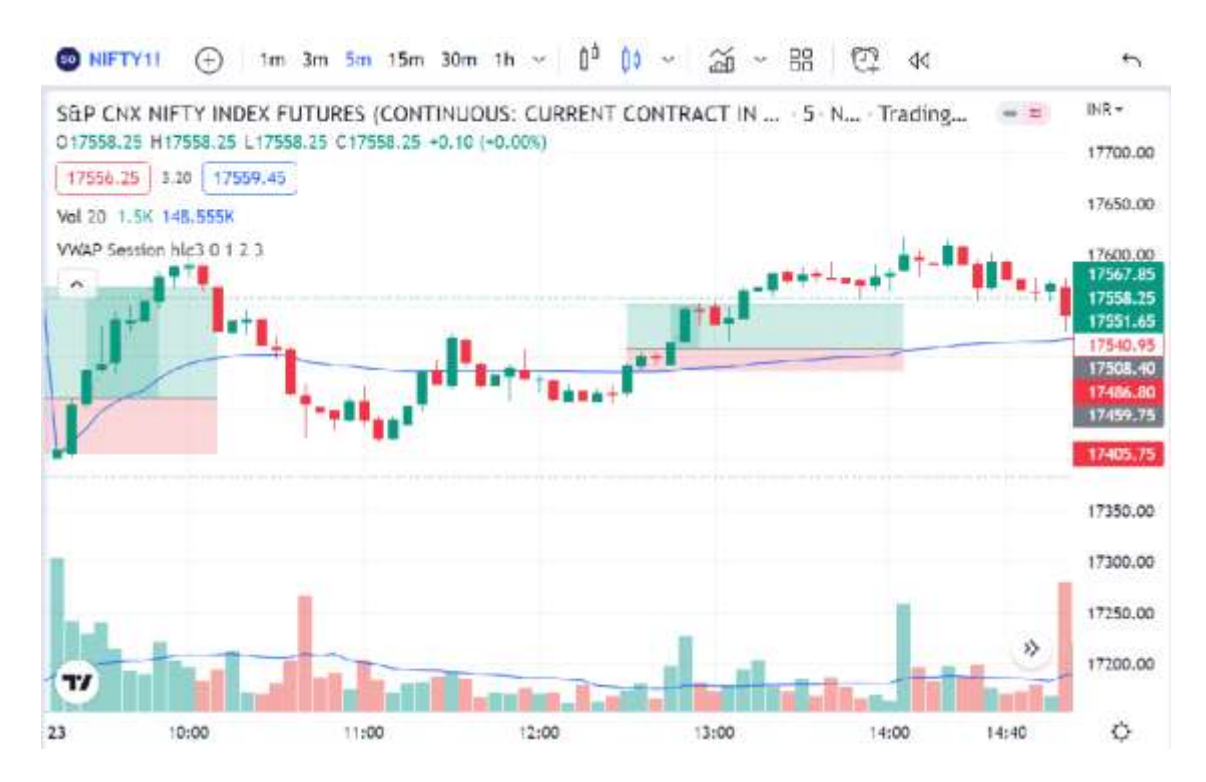
Nifty futures Chart on 23rd August 2022

Here it can be seen that the opportunity to trade was provided twice. Once in the morning with a risk reward of 1:2 and again in the afternoon with a risk reward of 1:2. Also it can be observed that