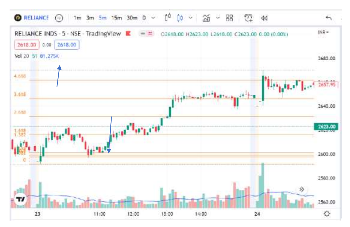
Breaks 1.618 but volume below 20 period MA. So No entry Breaks again but this time with volume above MA. Possible Long Entry

downside and reverses. Also observe the volume which is lower than the 20 period moving average