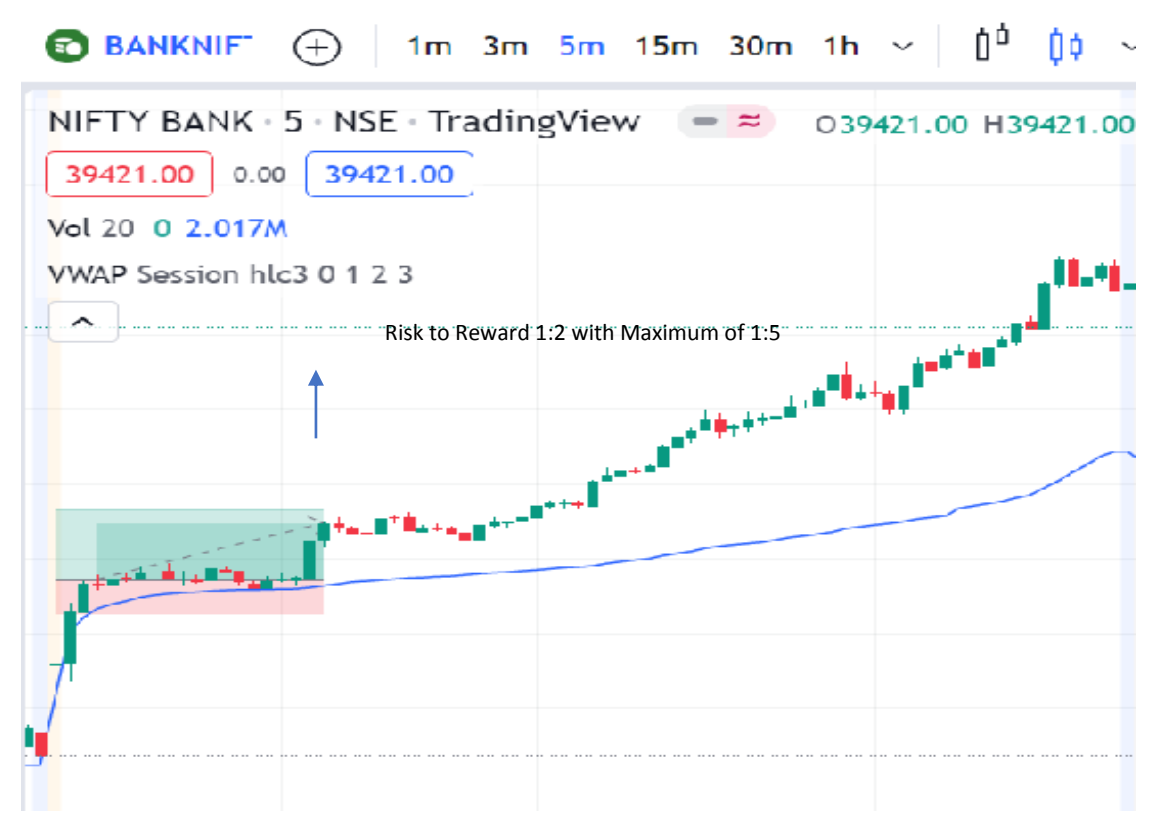
Bank Nifty Chart on 30<sup>th</sup> August 2022 We can see that after the first two closings above VWAP and crossing of the high of the second close, the index ( futures ) rallied towards bigger