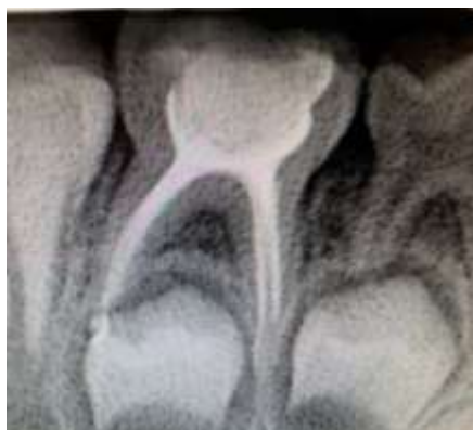
Figure 3: Incidence of post obturation flare-up