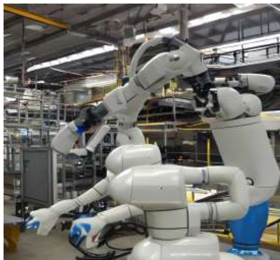
Fig: - 5