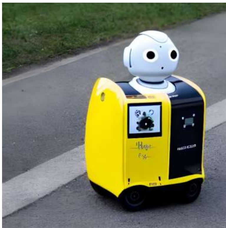
Fig: - 1

The objective of this research article is to present a summary of the many AI strategies used in machine automation, along with their advantages, disadvantages, and future solutions. This study intends to add to the existing discussion regarding the future of machine automation and the role of AI in it by shedding light on these concerns.