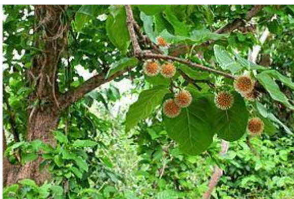
Figure.1 Morinda lucida plant

Herbs and their extracts are inexpensive and rich resources of active compounds that can be utilized as novel cytotoxic agents as well as can be used for the treatment of dermatological disorders associated with melanin hyperpigmentation. In vivo antitumor activity is an emerging research area in cancer biology. Process in the development of antitumor drugs, worldwide, has been focused on screening therapeutically effective and safe, synthetic and herbal molecules. There are numerous natural or synthetic drugs which were studied for their antitumor potentials, but none of them have uniqueness to meet all the desired requisites, that is, freedom from cumulative or irreversible toxicity, effective long-term protection, prolong stability and ease of administration[3-4].