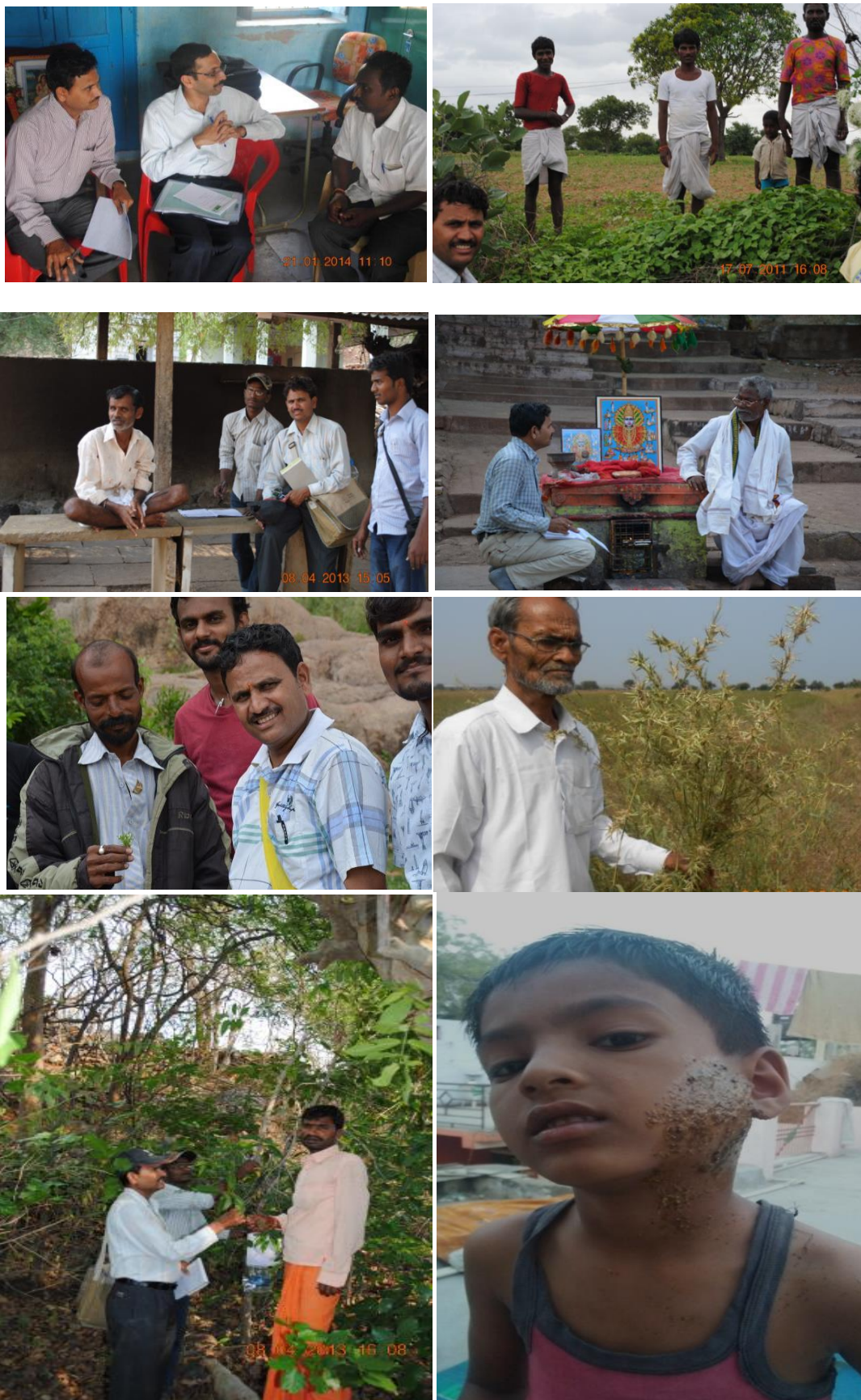
PLATE-2: Discussion with Traditional Knowledge Holders during Ethnobotanical Survey and drug application.