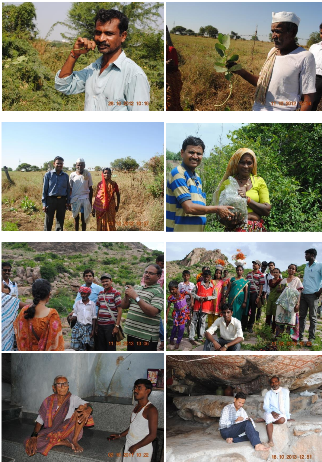
PLATE-1:Discussion with Traditional Knowledge Holders during Ethnobotanical Survey