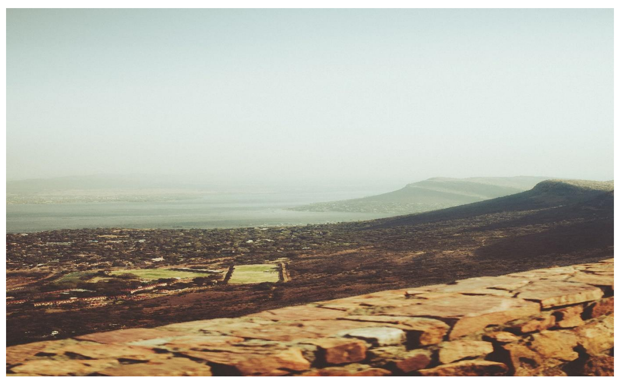
Figure-2. Hartbeespoort Dam (Modiselle, 2021)