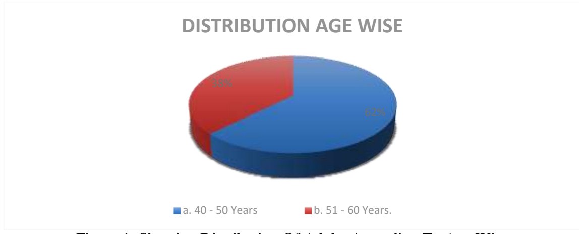
Figure 1: Showing Distribution Of Adults According To Age Wise