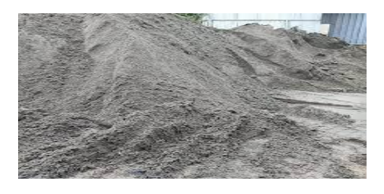
Fig. 1 M-Sand

For concrete buildings, manufactured sand (M-Sand) is used in addition to river sand. Crushing stiff granite stone yields manufactured sand. The crushed sand has square, grounded boundaries, has been cleaned, and is categorized as a building material and the material shown as Fig. 1.