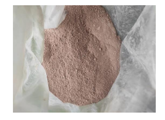
Fig. 4 Hydrotons

Hydrotons are excellent water absorbers, and as was already said, they gather extra water and store it for later use. It stops the damage that too much water would otherwise do to roots. For plants to receive the right amount of water and air, clay pebbles are typically utilized as a base layer or alongside other planting materials. across it. Expanded clay from of the original Hydrotons are brand distinctive. The hydrotons powders are shown in the Fig. 4.