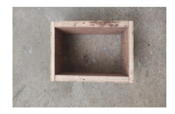
Fig. 6 Mold

This brick is made using wooden mold. Wooden mold is cheaper and easily available than iron. This mold is made to scale. And the wooden molds are easily we can remove. both constructed of wood and are produced in a carpentry store. For the brick to have a higher surface quality, all four sides wooden parts are even. Wooden molds are less expensive and will fit the function. The previously prepared mixtures are pour into the wooden mold. Mold dimensions used were 19 cm x 9 cm x 9 cm as shown in Fig. 6.