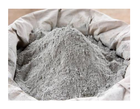
Fig. 2 Cement

Design and Fabrication of Composite Brick using Waste Plastic and Glass Materials