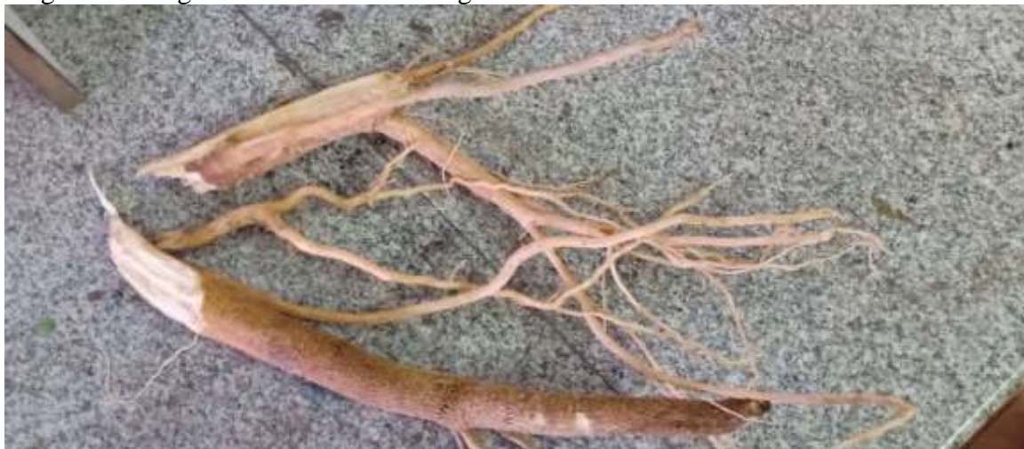
Fig 1: Moringa oleifera root

The roots were brown in colour (dark), with rootlets that were round, branching, and 4-8 cm long with a rough texture as shown in fig 1: