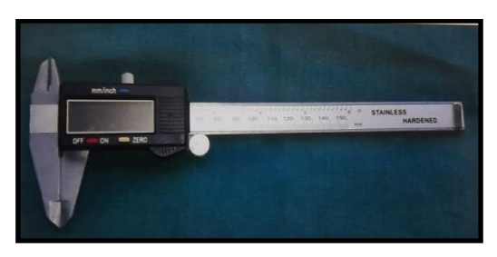
Figure 2: Digital Venire Calliper