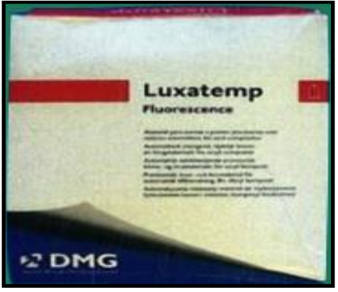
Figure 1: Luxatemp fluorescenc

This study was conducted in the department of Prosthodontics of Shree Bankey Bihari Dental College and Research Centre, Ghaziabad, Uttar Pradesh, India. The sole aim was to evaluate and compare the flexural strength of various provisional restorative materials used for provisionalization available commercially. Four commercially available temporary fixed partial denture materials were considered. They were: Poly methyl methacrylate based provisionalization materials available in powder liquid form namely Al. DPI selfcure tooth material A2. Trulon acrylic crown and bridge, Bis-acryl composite based temporization materials available as cartridge with dispensing gun and mixing tips. Bl. Protemp 4 temporization material, B2. Luxatemp fluorescenc, Artificial saliva