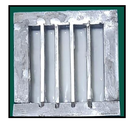
Figure 3: Metal Die