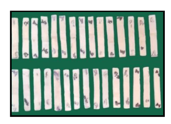
Figure 4: Specimens

TO EVALUATE AND COMPARE THE FLEXURAL STRENGTH OF PROVISIONAL RESTORATIVE MATERIALS IN FIXED PARTIAL DENTURE Section A-Research paper