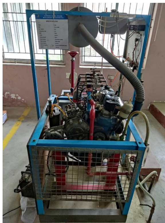
Figure 2 engine used for testing.