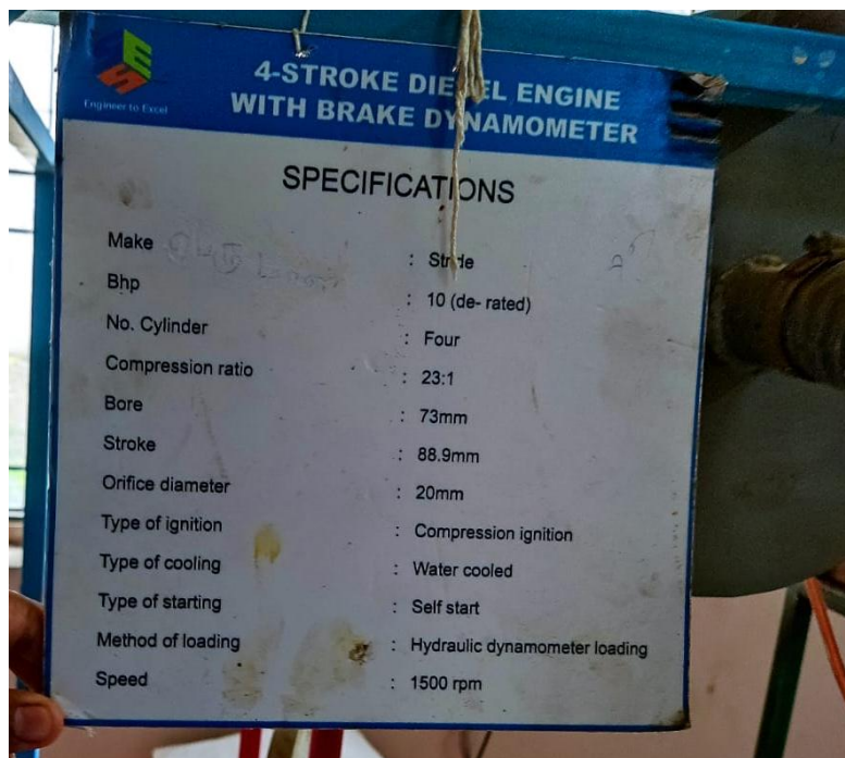
Figure 1 the specifications of engine.