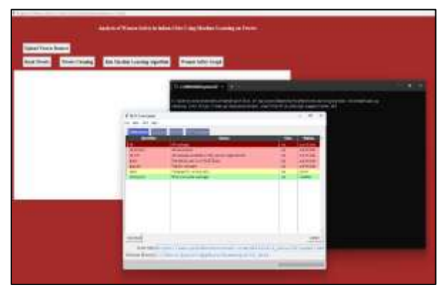
Figure 3. Download nltk file

Once all packages download also that window turn to green color to indicate download process complete and also you can close that window.