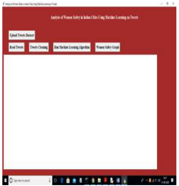
Figure 4. Output window