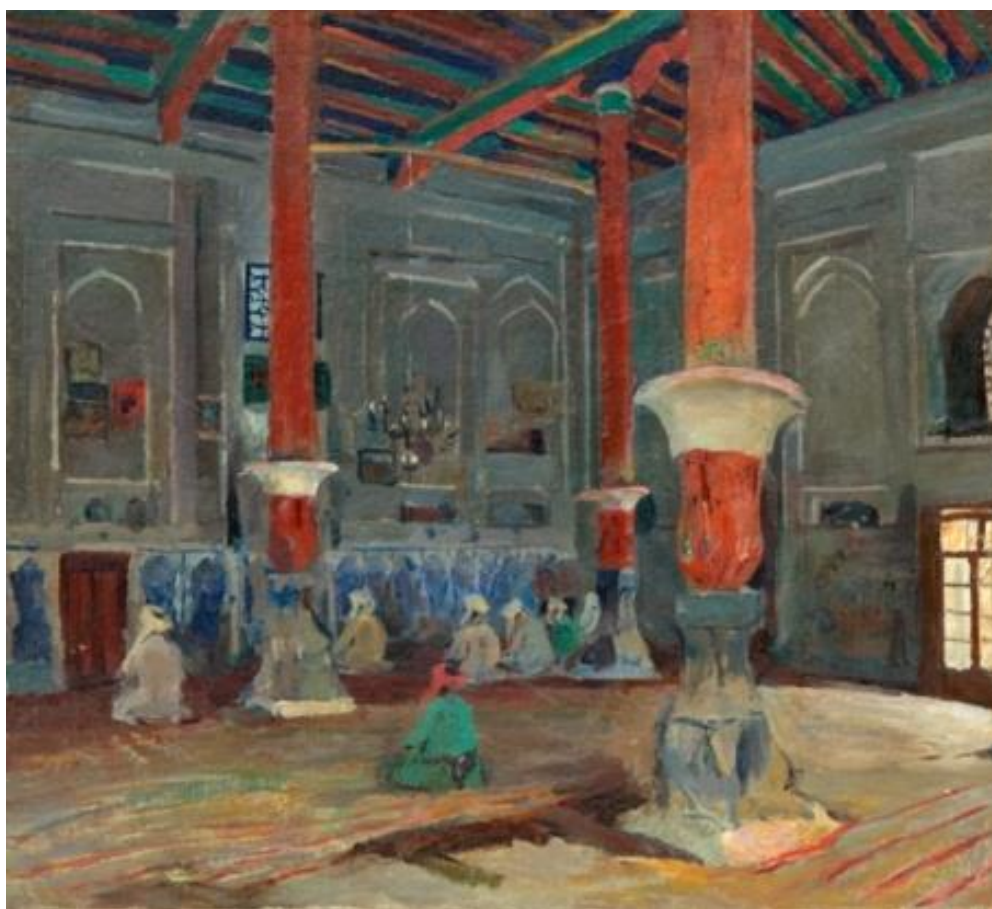
Figure 1. Benkov P. Mosque

took a leading place in its rise. The pattern has turned from the level of "simple decoration" into a unique art that expresses Islamic ideas [2]. In the creation of paintings, the pattern is a means of reflecting the "symbolic image of the world" and expressing its ideas in a literal sense. [3].( Fig. 2).