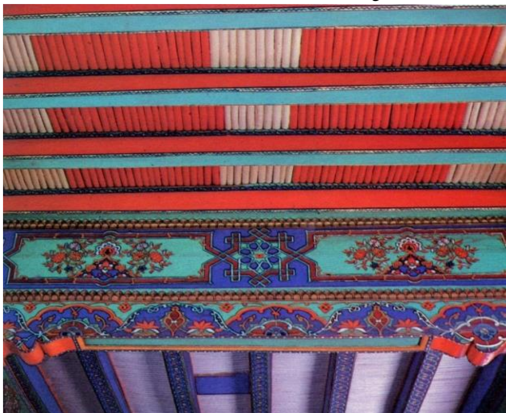
Figure 3. Lutfullo Maulana Mosque. Part of the pattern on the bolars. Quiet. The beginning of the 20th century [4]

Parts of architectural monuments and their decorations have their own symbolic meaning. In this place, the ceiling inside the roof is likened to the universe, and the roof itself is likened to a mountain, a high hill.