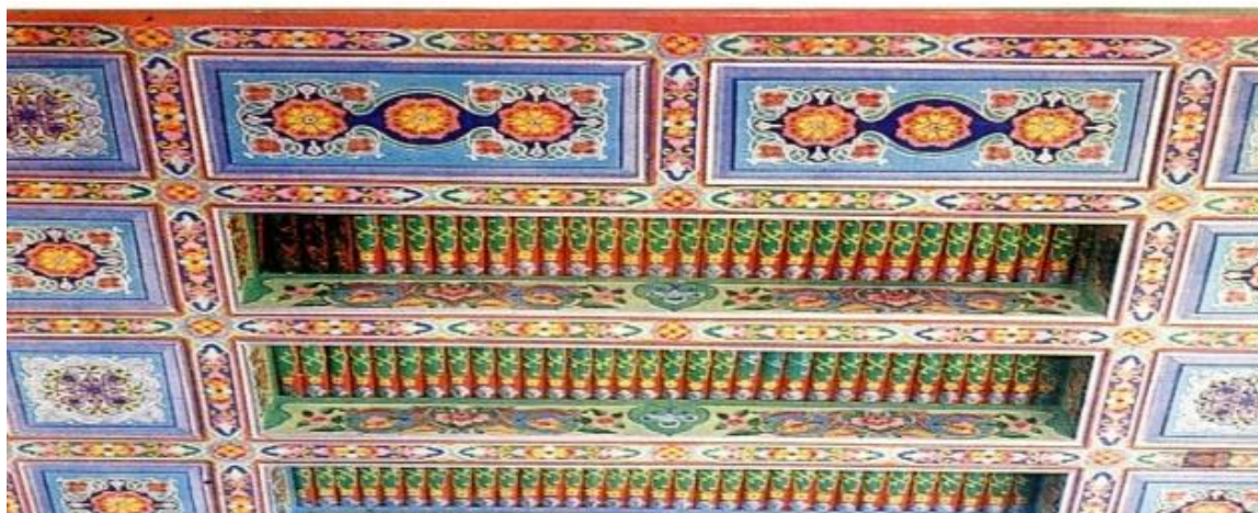
Figure 2. Namangan. Khoja Amin Mosque

Parts of architectural monuments and their decorations have their own symbolic meaning. In this place, the ceiling inside the roof is likened to the universe, and the roof itself is likened to a mountain, a high hill.