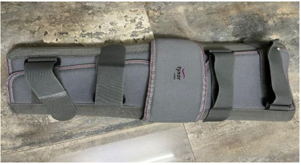
Fig: 1 Brace