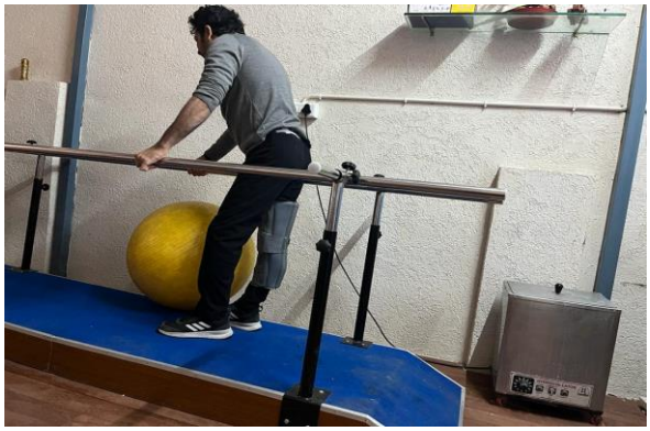
Figure 2 Man with BRACE on Right Leg, forward stepping, Ball Kicking