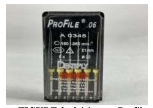
FIGURE 3. 0.06 taper Profile

The specimens were randomly divided into three groups. The canal of each specimen was instrumented using a crown down technique with 0.06 taper Profile® ( FIGURE 3)(DENTSPLY Tulsa Dental, Tulsa, OK) nickel titanium rotary files to a master apical file size 30. Canals assigned to group 1 were irrigated with 2 mL 1.0% sodium chloride between each file.