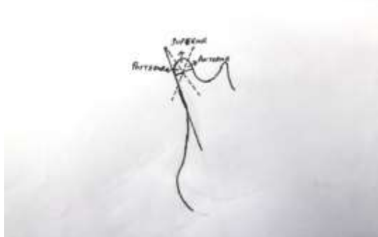
FIGURE 2: Anterior, superior and posterior parts of condyle

The surface of the condyle was subdivided in an anterior, superior, and posterior part (Figure 2).