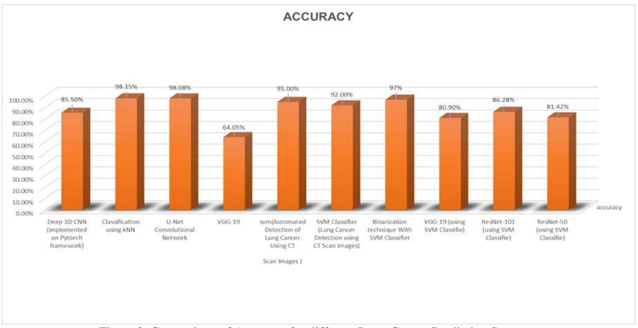
Figure 2: Comparison of Accuracy for different Lung Cancer Prediction Systems