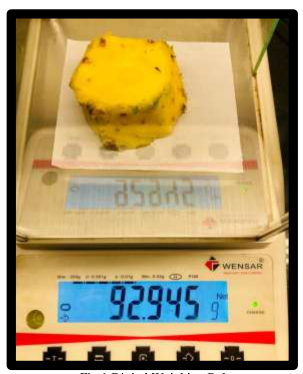
Fig 1:Digital Weighing Balance