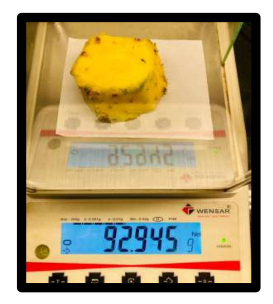
Fig 2:Methanolic extract of pineapple