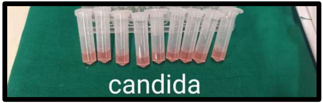
Fig 3: Growth of Candida species