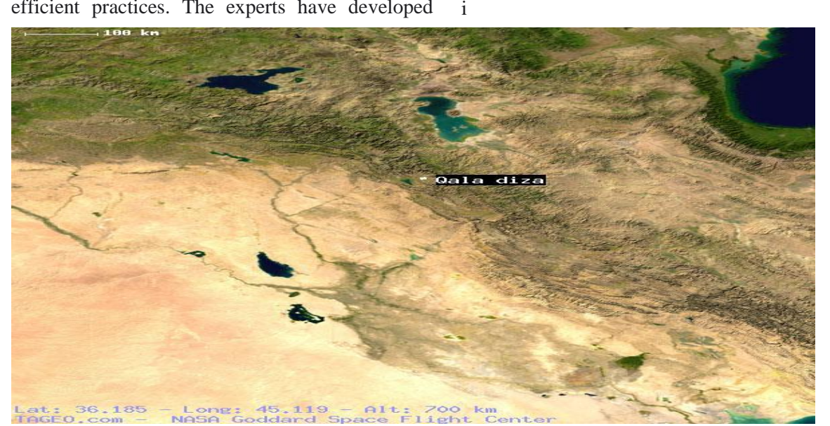
Fig(1) Qaladiza location

This experiment was conducted at the Qaladiza city, locating on 120 Km north of Sulaimania city, Kurdistan region, Iraq , with 36° 10' 19" N; Latitude, 45° 8' 17" E; Longitude, and Altitude 576 meters above sea level (masl). The study location was appointed by GPS and Google earth . a: World ; b: Iraq ; c: Sulaimania ; q: qaladiza as shown in Fig. (1).