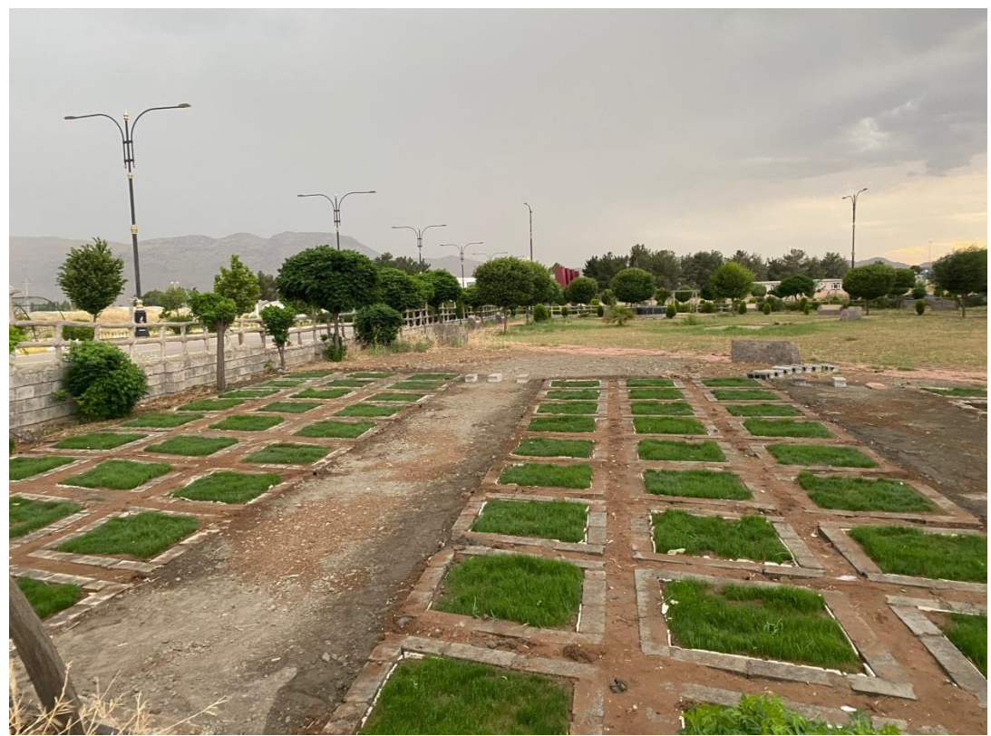
Fig(3) lawn growth