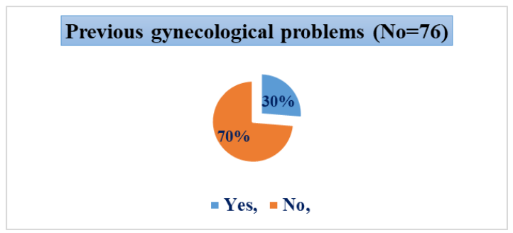
Figure (1): Distribution of the studied female nurses regarding previous gynecological problems (No=76)

(48.1%) of nurses revealed that menstruation lasts > 8 days.