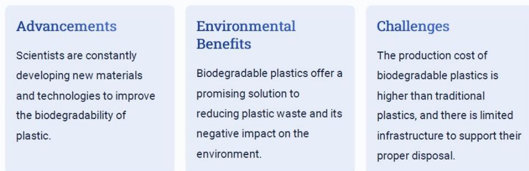
Figure 2: Future of biodegradable plastics

More evaluation utilizing original polymers polluted wastewater is required to assess the possible usage of microorganisms for polymer removal. Further work is needed on issues related to plastic cleanup, plastic toxicity, and microbe use. It is important to effectively advocate for the transfer of plastic polymers from wastewater to a suitable area for deposition/incineration to prevent them from entering the aquatic environment, which includes rivers and seas. Evaluating the cumulative impact on ecosystems requires coordinated long-term cleaning efforts.