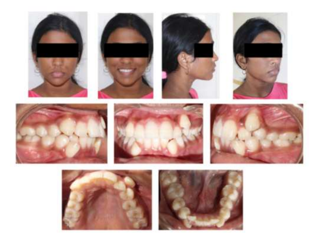
Figure 1: Pretreatment Intra-oral and Extra-oral photographs