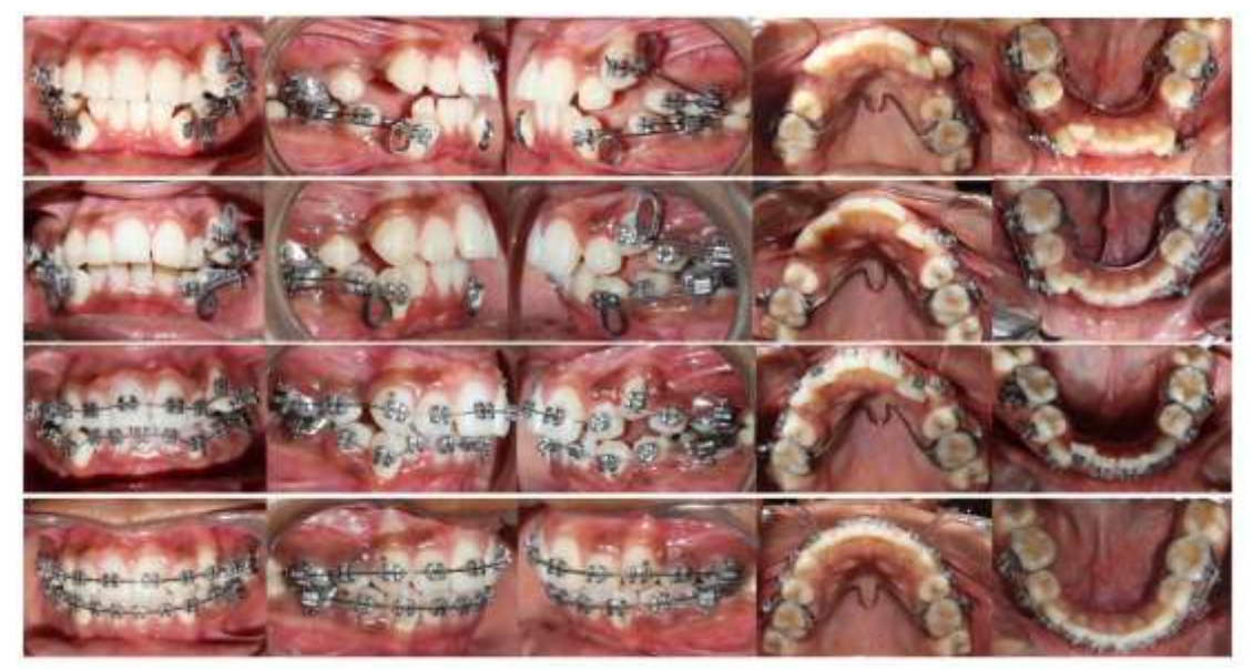
Figure 3: Treatment progress with segmental and continuous mechanics