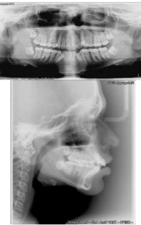
Figure 2: Pretreatment orthopantomogram and Lateral Cephalogram