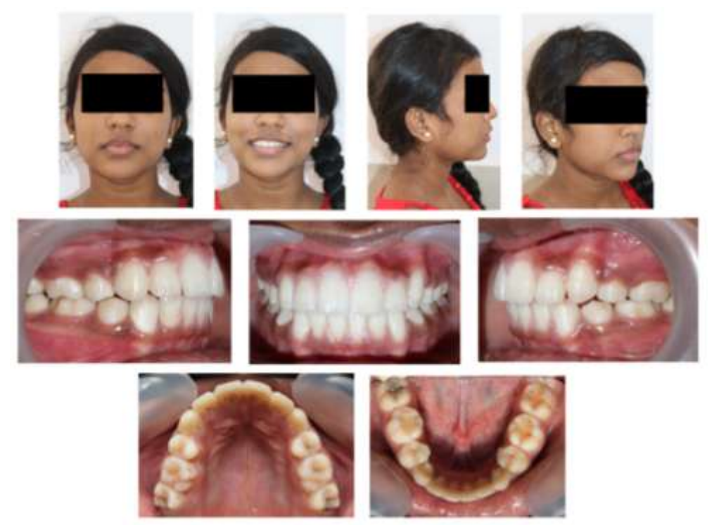
Figure 5: Post-treatment Intra-oral and Extra-oral photographs