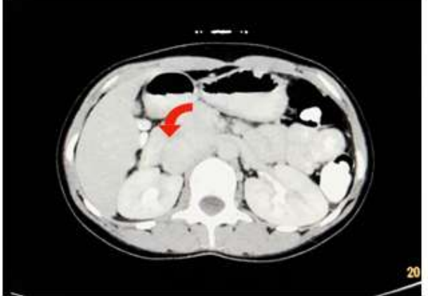
Fig 2A, 2B and 2C.Axial non contrast ,arterial phase ,delayed phase images: showing a well circumscribed, right adrenal mass

Few(5-6) small focal lesions showing hyper enhancement on arterial phase were noted in both lobes of liver measuring upto 5mm. They were not visualised on venous/delayed phase-possibility of metastasis was made.