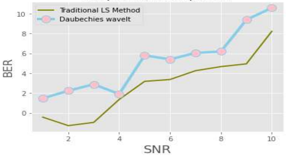
Fig. 1. Bit Error Rate Prediction (BER) analysis of Daubechies wavelet in comparison with Traditional Least Square Method. Blue: Daubechies wavelet, Green: Least Square Traditional Wavelet Method, Y-axis: Accuracy, X-axis: Comparison of Daubechies Wavelet with Traditional Least Square Method.