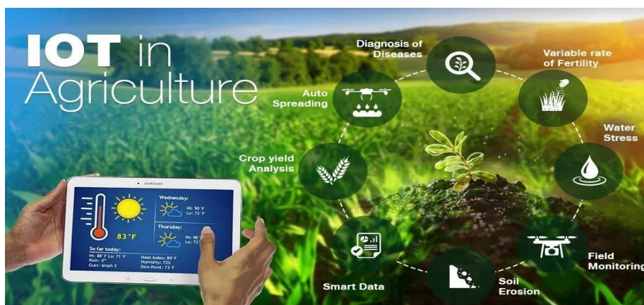
Fig 2: Smart Farming

Another clever agriculture-based innovation company [6] operating in India has successfully created devices [Fig. 2] based on the IoT platform that provides advances in technology in business farming. It collects data on weight, soil, wind direction, precipitation, climate, and solar radiation. To measure soil temperature, soil wetness, and soil ph, tests are conducted on the soil. The data is collected, dissected, and provided in bite-sized pieces on the cloud. The producers can also connect with one another and exchange information using a flexible application.