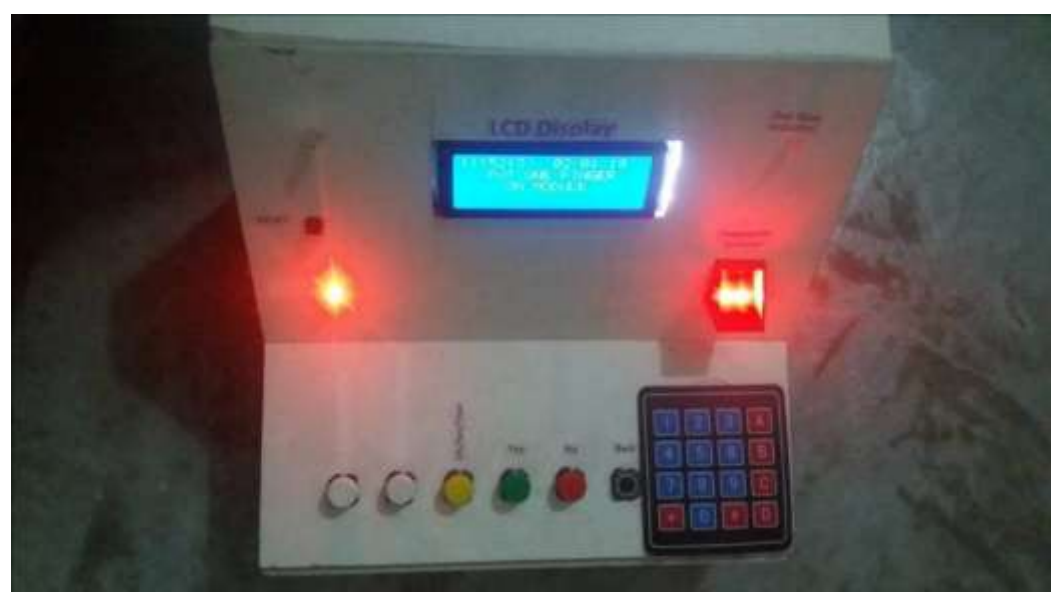
Fig. Real Image of the Project