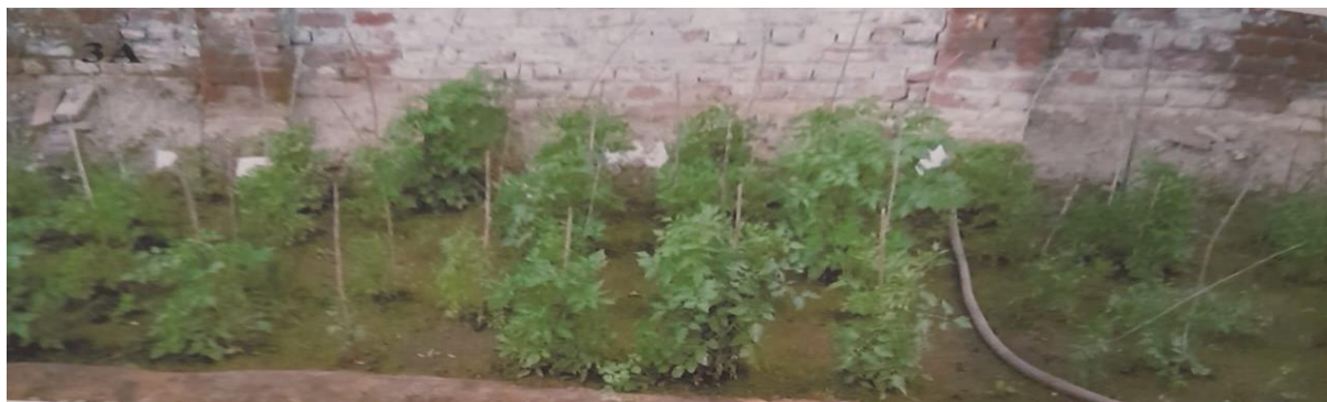
Sample crop of Solanum lycopersicum

S. lycopersicum Cv." HISAR Lalima" was sown in a nursery plot, one-month-old seedlings were transplanted at a distance of 30x30 cm, at the local garden of Sh. B.P. Jain Delhi Road, Rohtak Haryana during Rabi season 2014-15 and 2015-16 and replicated thrice. By providing agronomic practices followed throughout the season. No insecticides were applied at any stage of crop growth. The infestation of insect pests was recorded from sowing to harvest of the crop. Observation of the population of insect pests was on randomly selected tomato plants in the experimental area from the insect pest appearance until the harvest of crops at weekly intervals. The infestation of H. armigera , B. tabaci , and A. gossypii on the plant was recorded by counting randomly selected 10 plants from each replication. Singh and Kaushik, (1990) have been reported that the population of insect pest leaf hopper and white fly were recorded on three layers (middle, upper, and lower) from each selected plant. It was correlated with the meteorological weather parameter such as temperature (maximum and minimum), RH (RH morn and RH evng ) rainfall RF, and wind speed, and this data was collected from Krishi Vigyan Kendra Rohtak Haryana.