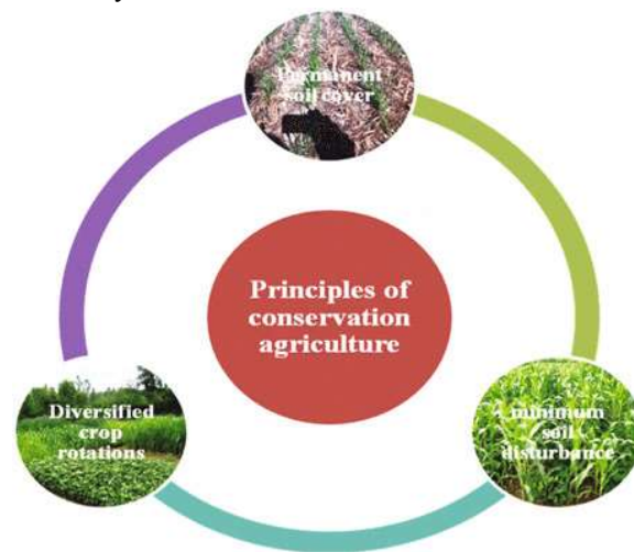
Fig 2: The conservation agriculture covers three basic principles: (i) direct seeding or planting or minimum soil disturbance; (ii) minimum soil disturbance or direct seeding, maintaining soil cover permanently or semipermanently ; and (iii) diversified crop rotation

the means by which specialists allude to contingent autonomy and cross-over.