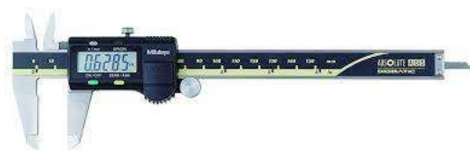
FIGURE 2. DIGIMATIC CALIPER

specimens was standardized to 20mm by reducing the coronal tooth structure and the working length was set to 19mm.