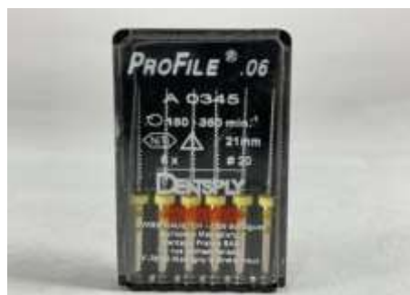
FIGURE 3. 0.06 taper Profile

The specimens were randomly divided into three groups. The canal of each specimen was instrumented using a crown down technique with 0.06 taper Profile® (FIGURE 3)(DENTSPLY Tulsa Dental, Tulsa, OK) nickel titanium rotary files to a master apical file size 30. Canals assigned to group 1 were irrigated with 2 mL 1.0% sodium chloride between each file.