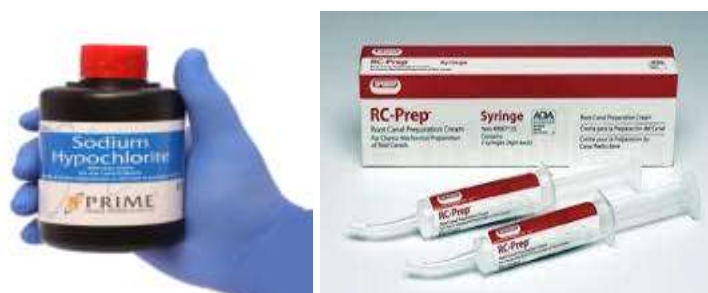
FIGURE 4. SODIUM HYPO CHLORIDE AND RC-Prep™

Canals assigned to group 2 were irrigated with 2 mL 1.0% sodium chloride between each file and the canals were flooded with 17% EDTA (Pulpdent Corp., Watertown, MA) prior to the use of each file. Canals assigned to group 3 were irrigated with 2 mL 1.0% sodium chloride between each file and RC-Prep™ (FIGURE 4)(Premier Dental, Philadelphia, PA) filled the pulp chamber prior to the use of each file. The curvature of the canal, the volume of the chelating agent used and the time that it took to instrument the canals were recorded.